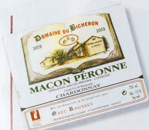
Domaine Bicheron T +33 (0)3 85 36 94 53 UK Agent: Richards Walford. T 01780 460 451