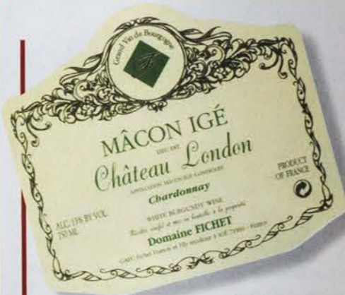
Domaine Fichet T +33 (0)3 85 33 30 46 UK Agent: Stone, Vine & Son. T 0845 061 4604