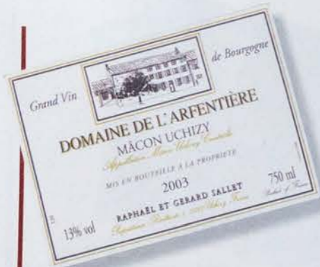
R & G Sallet T +33 (0)3 80 40 50 45 UK Agent: Roger Harris Wines. T 01603 880 171