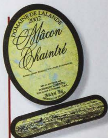
Domaine Lalande T +33 (0)6 09 93 15 33 UK Agent: Bibendum. T 020 7449 4120